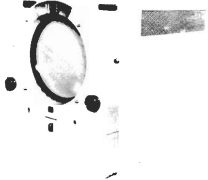
AP 103634 DISPLAY ASSEMBLY